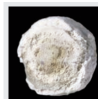
Figure 4 – Spent Odoroxidant SP Media

The media's capacities depend on the targeted compound as well as the dry-scrubbing media itself. Although activated carbon has a high capacity for increased molecular weight, less reactive gases and impregnated media have higher capacities for both a broad and more specific range of reactive gases. The table below projects which media types will have the highest capacity for common gases.