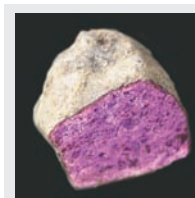
Figure 3 – Spent Competitor Media

4) moisture content. Two cross-sections of spent media are shown below – a competitors' media appears in Figure 3 and Purafil ESD Odoroxidant SP media in Figure 4. When the outer shell of the competitor's media reacted with contaminants, its gases were unable to penetrate the pellet. Only the pellet's outer shell reacted with the contaminants. On the other hand, the Odoroxidant SP media's core is spent (grey or white), which proves the impregnant is applied throughout the pellet. The sodium impregnate efficiency for Purafil's patented Odoroxidant SP is 12%, which is the highest available on the market.