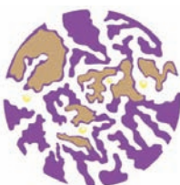
Figure 2 – Visualization of Chemisorption

Chemically impregnated media remove gases by chemisorption. Chemisorption is defined as an interaction between a gas compound and the media, which results in transferred or shared electrons, i.e. a chemical reaction. It is a function of the surface area of the media and its chemical makeup (base materials, impregnant, and moisture content). Chemisorption is not a pure physical interaction. It is, however, a permanent process that involves a chemical change. The reactions typically form stable, organic or inorganic salts or convert the compound to water vapor, carbon dioxide, and some compounds more readily absorbed by other adsorbents. Figure 2 depicts chemisorption on chemically impregnated media. Both adsorption and chemisorption occur on the chemically impregnated media's surface, but chemisorption is the most effective removal method.