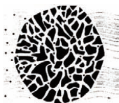
Figure 1 – Visualization of Adsorption

Activated carbon removes gases by adsorption. By definition, adsorption is the process by which one substance is attracted to and held on the surface of another. It is a function of the dry-scrubbing media's surface area, of which activated carbon has the highest surface area to mass ratio. Since adsorption is a surface phenomenon, it is essentially totally reversible, i.e. desorption. Adsorption works well for higher molecular weight organics (i.e. toluene), but for lower molecular weight compounds (i.e. hydrogen sulfide), carbon capacities are lower and desorption often occurs. Figure 1 depicts the adsorption on activated carbon.